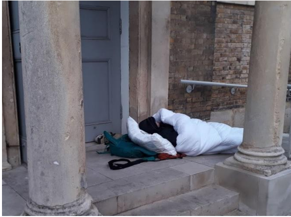
Outside St Elizabeth's church next door

It is an occupational requirement that the appointed person is a professing and practicing Christian.